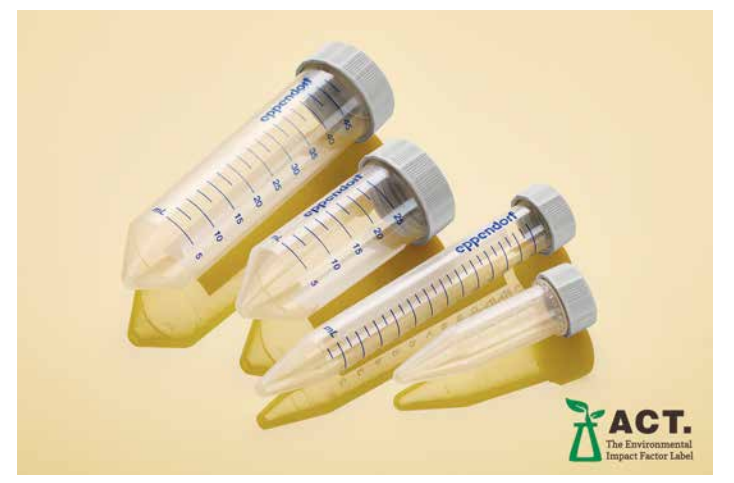
Figure 2: Eppendorf Tubes® BioBased with screw caps in volumes of 5.0 to 50 mL

As users of laboratory equipment prefer independent validation, we cooperate with the NGO My Green Lab since 2017 for different approaches. In 2022, we received further ACT labels for our products, including BioBased Tubes.