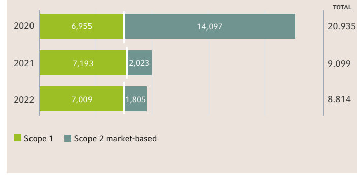
Figure 1: Sope 1 and Scope 2 emissions in t CO<sub>2</sub>, GRI 305-1, -2

In line with these topics, we are taking action to protect the climate as well as social standards and lower future risks to our business model. This includes increasing our energy efficiency – which has the added benefit of lowering our dependence on energy prices – and meeting the increasingly stringent requirements set by our stakeholders.