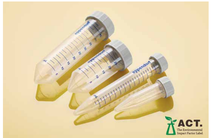
Figure 2: Eppendorf Tubes® BioBased with screw caps in volumes of 5.0 to 50 mL

As users of laboratory equipment prefer independent validation, we cooperate with the NGO My Green Lab since 2017 for different approaches. In 2022, we received further ACT labels for our products, including BioBased Tubes.