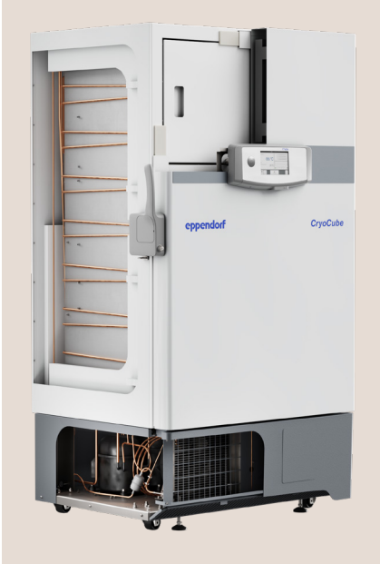
The CryoCube® F740hi ULT freezer is constructed with sealed cooling loops and only hydrocarbon gases to ensure adherence to regulations.

These steps represent one more building block in a longer Eppendorf sustainability story.