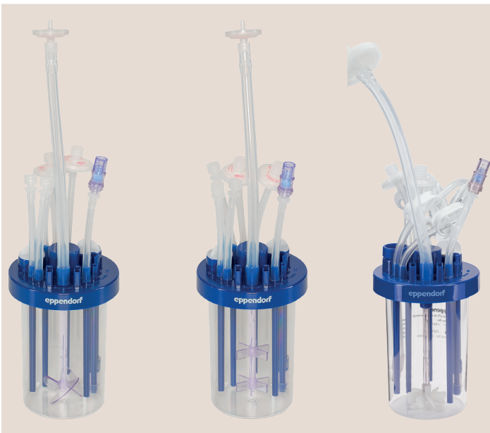
BioBLU 0.3c for cell culture

The smart design of the Eppendorf DASbox makes the 4-fold units ideal for parallel processing of up to 24 bioreactors. Together with the DASware® software solutions, the DASbox supports process development following the Quality by Design (QbD) approach by providing comprehensive information management, integration of third-party analyzers, and Design of Experiments (DoE) tools as well as remote access.