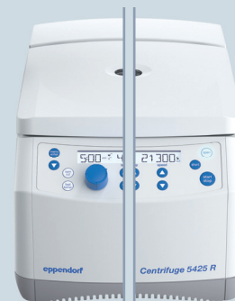
rotary knob version