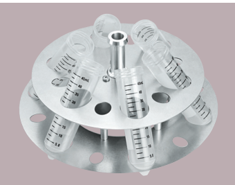
Rotor for 6 × 50 mL conical tubes. Also accommodates 6 \times 15 mL conical tubes (F-35-6-30).