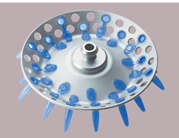
Rotor for 48 \times 1.5/2 mL microcentrifuge tubes (F-45-48-11). Can be stacked to double the capacity.